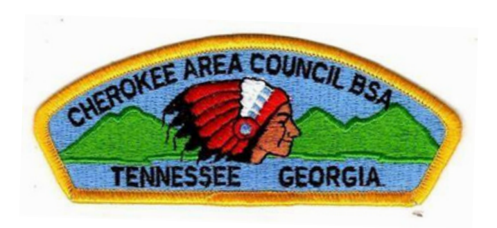
Ship 2556 Cherokee Area Council