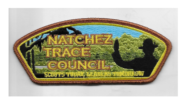
Ship 13 Natchez Trace Council