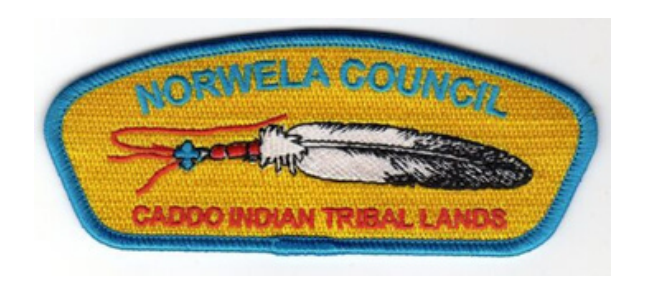
Ship 132 Norwela Council