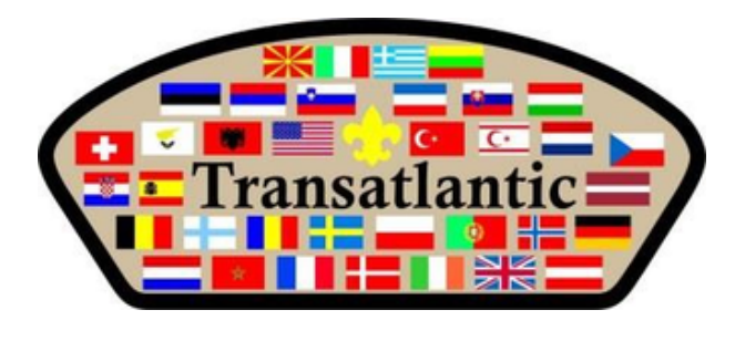
Ship 482 Transatlantic Council