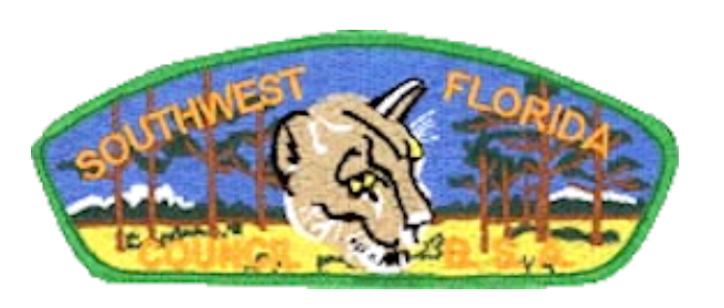
Ships 1777 and 1776 Southwest Florida Council