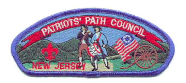
Ship 1510 Patriots' Path Council