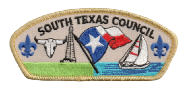
Ship 79 South Texas Council