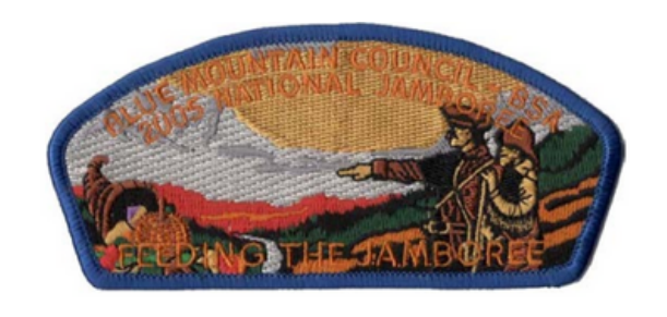
Ship 19 Blue Mountain Council