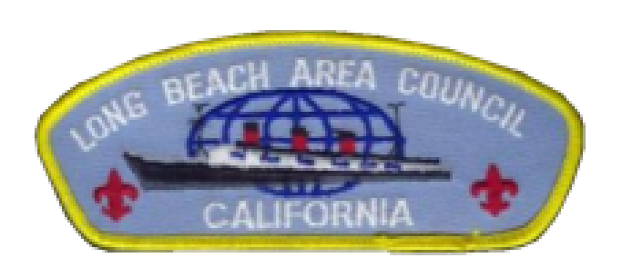
Ship 533 Long Beach Council