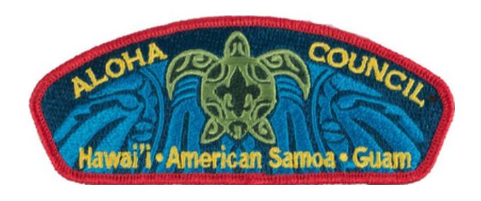
Ship 5177 Aloha Council