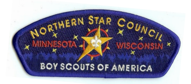
Ship 9339 Northern Star Council